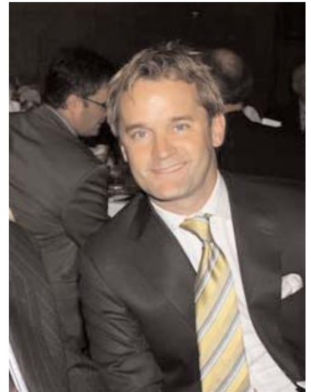
Gala host Seamus O'Regan